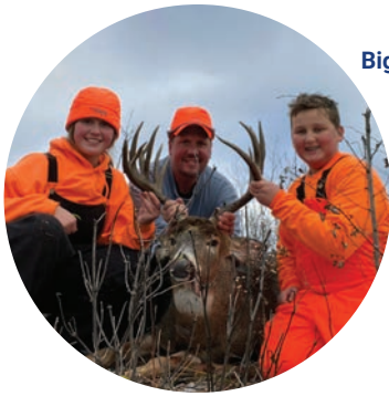
Big Buck Contest