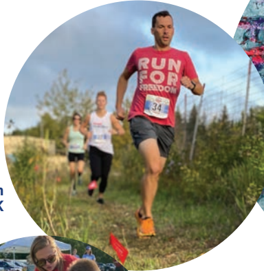
Renegade Trail Run 25K and 5K