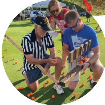
Take a Swing at Hunger