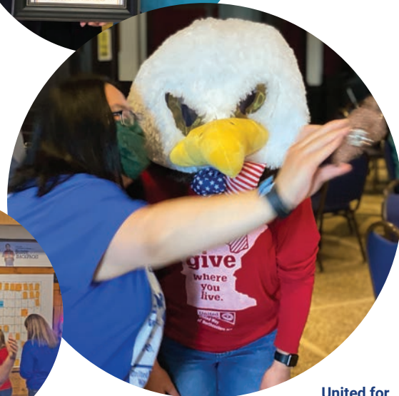
United for Veterans Cash Raffle