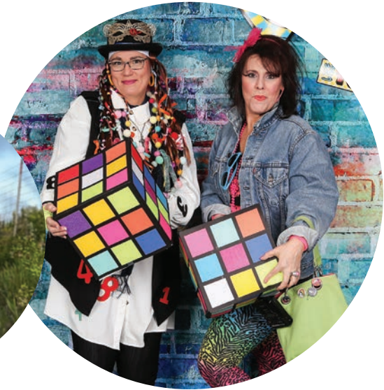
Power of the Purse