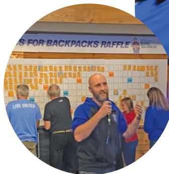
Bucks for Backpacks Cash Raffle