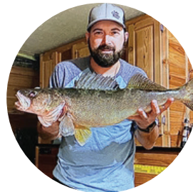
Making REEL Change