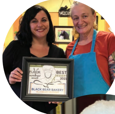
Flavor of the North Restaurant Month

Ladies Event Supporting Imagination Library program.